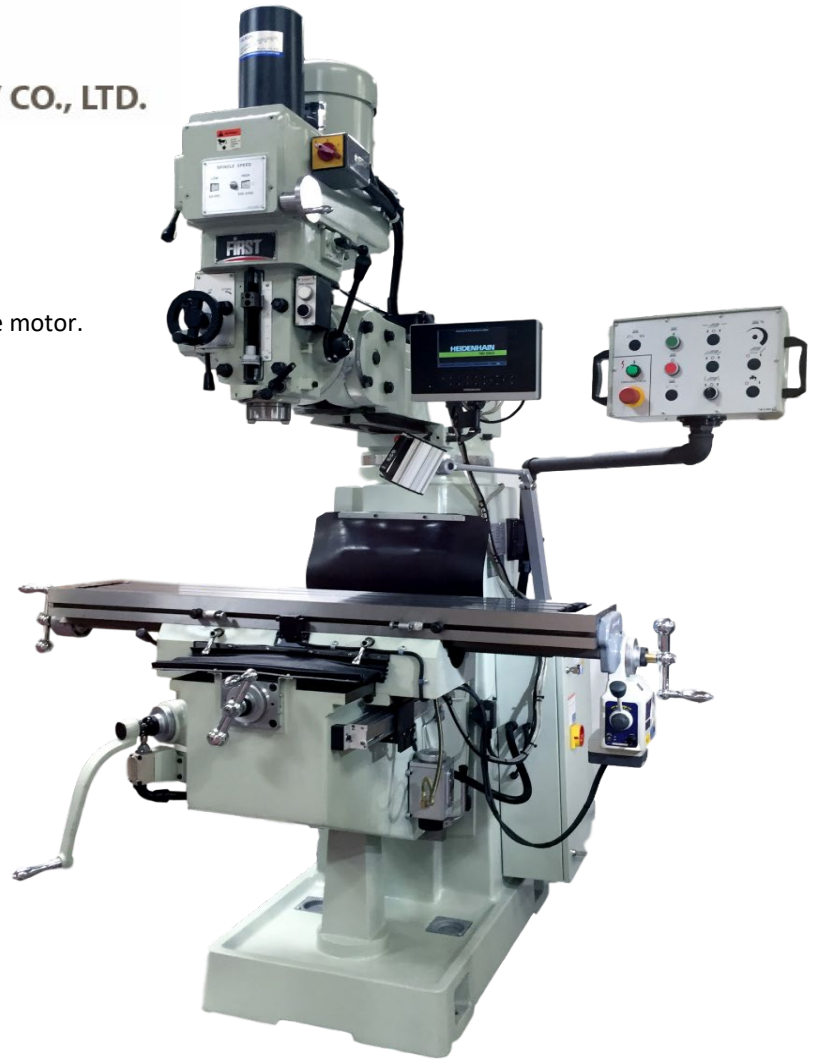
Machine shown with optional accessories

The simple and reliable one-shot lubrication is used to lubricate all slideways and leadscrews.